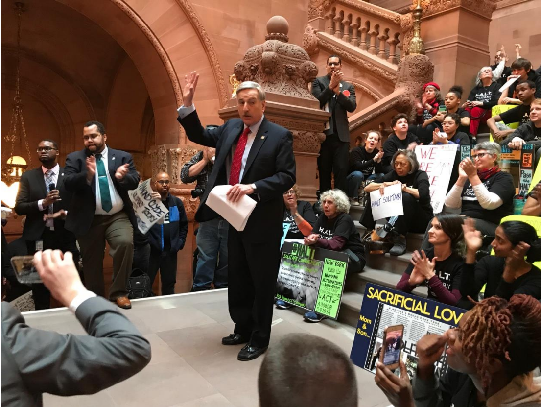
Committee Chairman David I. Weprin and Assemblymember Victor Pichardo at a solitary confinement rally.

confinement of vulnerable people, and restrict the criteria that can result in such confinement, improve conditions of confinement, and create more humane and effective alternatives to such confinement. The Committee will again advance these bills for consideration in 2019 and will continue to consider other bills to limit SHU time in New York State.